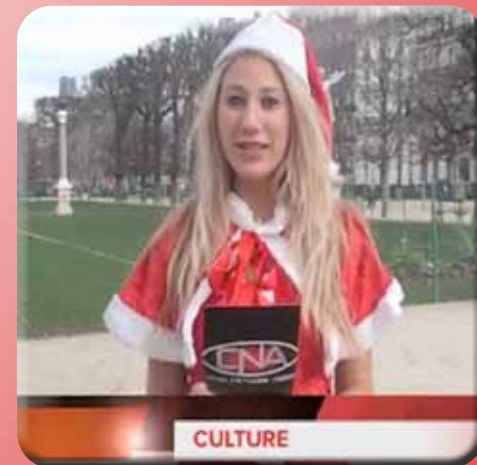
Freedom of Speech